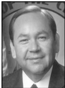
Governor Bill Anoatubby